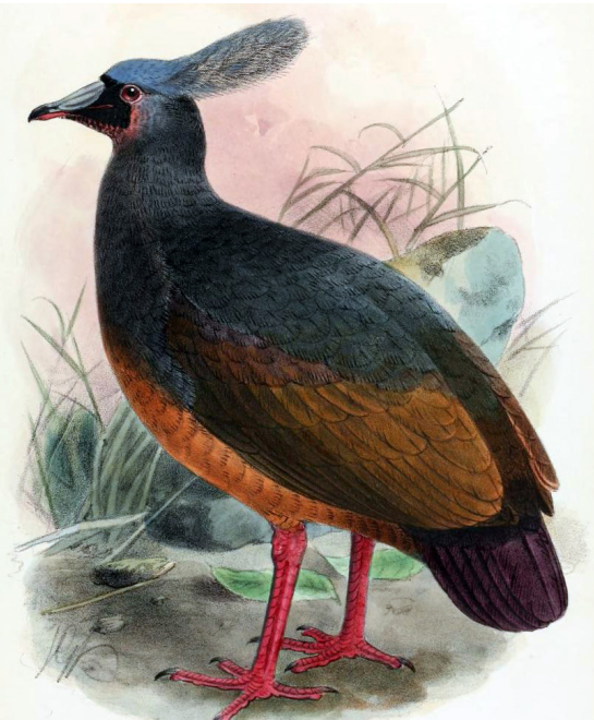
Choiseul Created Pigeon, extinction attributed to feral and free-roaming cats.

Outdoor cats have also been identified as the primary host in the transmission of toxoplasmosis to wildlife, a disease which has caused death in manatees and other mammals.