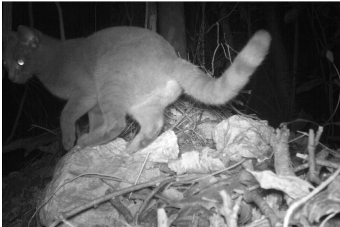
Feral cat on top of a Key Largo woodrat nest.

Trap, Neuter, Return (TNR) programs do not protect cats from the hazards of outdoor life, but they lead to the loss of native wildlife because these cats continue to roam and hunt when released.