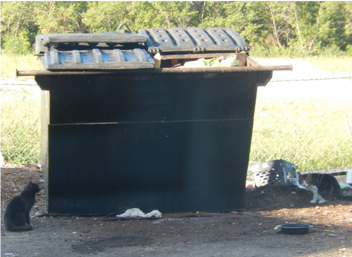
Proper sanitation practices can help prevent cats and native wildlife from becoming a nuisance.

Most of the time, the life of an outdoor cat ends in tragedy; the life expectancy of an outdoor cat is less than 5 years. Outdoor cats are exposed to a host of diseases, such as rabies, ringworm, feline leukemia virus (FeLV), and feline immunodeficiency virus (FIV). Outdoor cats are also injured and killed by dogs/coyotes and are frequently hit by cars.