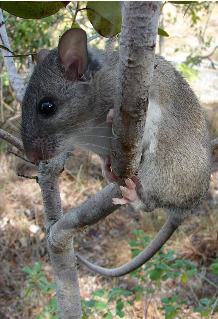
Key Largo Woodrat

Here on Key Largo, outdoor cats are a major factor in the severe population decline of the endangered Key Largo woodrat and the endangered Key Largo cotton mouse. These endangered species play a critical ecological role in the function of tropical hardwood hammocks as they disperse seeds and serve as a food source for threatened species, such as the eastern indigo snake.